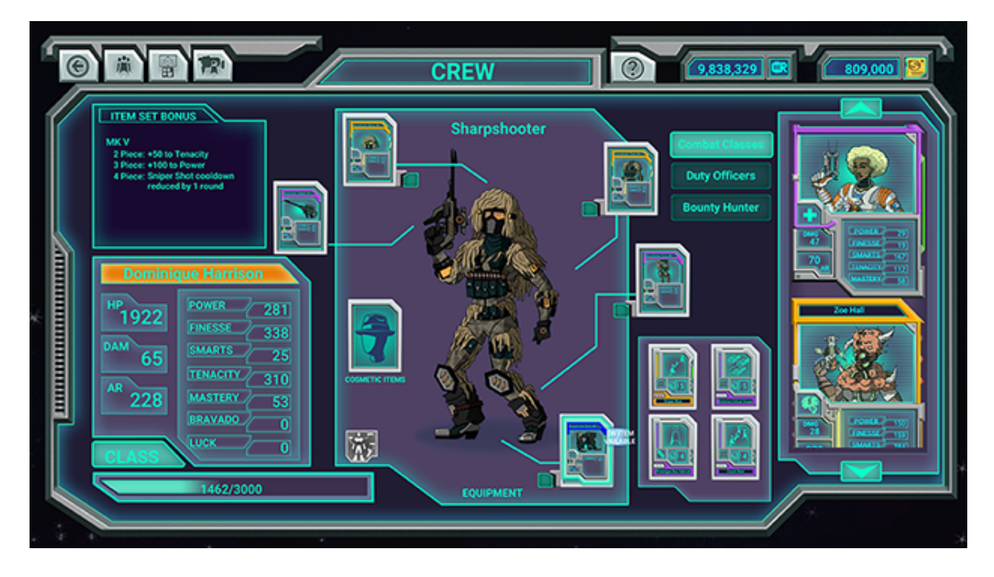
Deep Character Progression Trees – Assemble and oversee a diverse and robust team of loyal crew members. With 35unique crew classes, you can manage your progression and XP to optimize the crew you want to lead.

Extensive Loot Collection – With thousands of items to collect, BRIG 12 offers an abundant amount of space loot. Each item has varying rarity and stats and can equip your crew, provide them skills and attacks, or help craft augments to aid in battle. Loot is earned during battles or turning in bounties. You can also sell loot for credits or salvage them for new items to help manicure your collection.